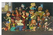
Total Drama Island