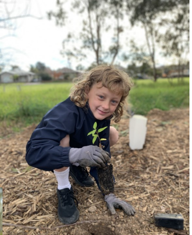
It will be very satisfying for students to know that, as the trees grow and beautify the area, that they were responsible for making it happen.